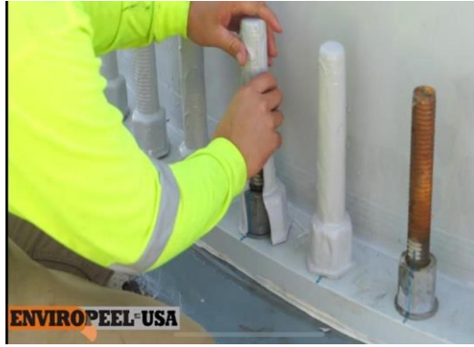
Foundation Bolt and Structure coated with EP to protect from corrosion